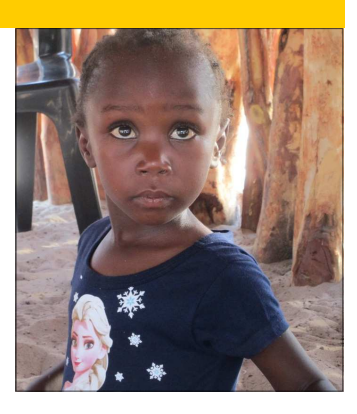
Look at these beautiful children!

All of them were visited during our last round of home visits to the North and have been confirmed as perfectly suitable candidates for the Early Intervention Centre, provided their families manage to find accommodation for them in Windhoek.